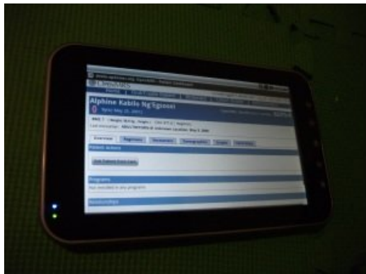
Figure 1: Ovim Tablet in action on EMR

When clients engage us, we will help them develop an electronic database and transform their paper format into an electronic equivalent. Our software that runs on our Ovim Tablet will help doctors manage patients care in a mobile domain. We have tested our Tablet and found it ready for any EM2R function in Nigeria (see figures below). Table 1 shows the features of our system.